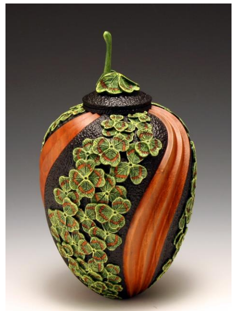
Lucky twist III