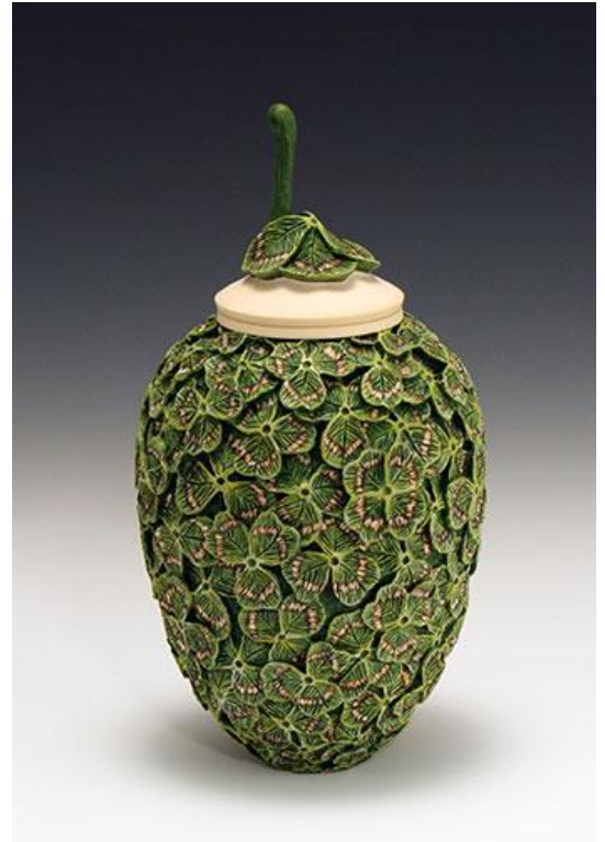
Feeling Lucky II by Dixie Biggs, holly and acrylic paint (3" dia. x 5"), 2011