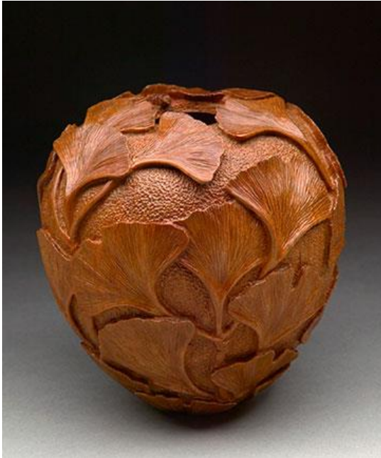
Natural History by Dixie Biggs, cherry (5" dia. x 5"), 2006