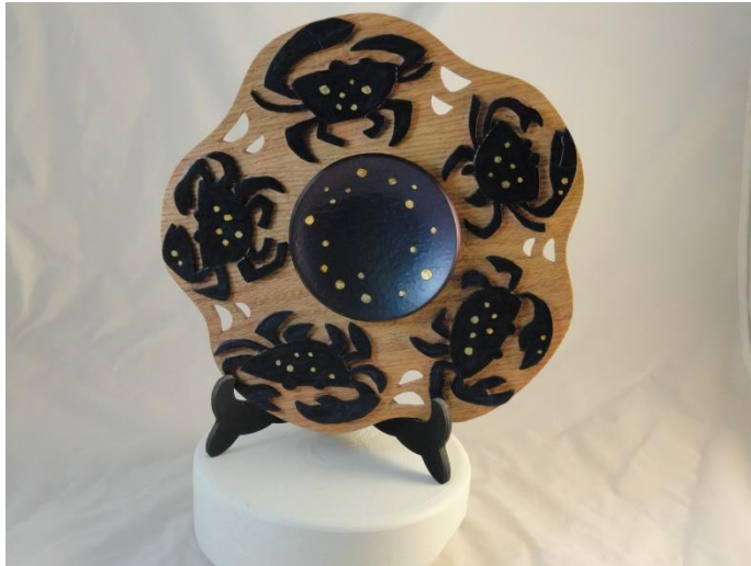
5 Dick Kelly