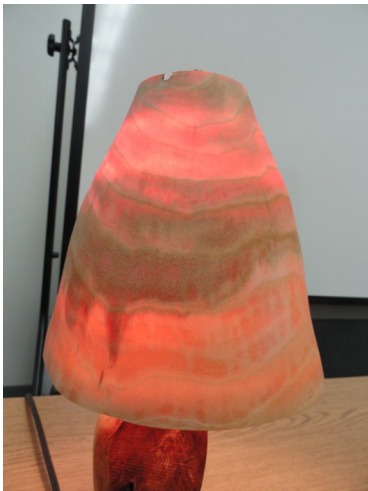
Two of Peter's Success stories !!