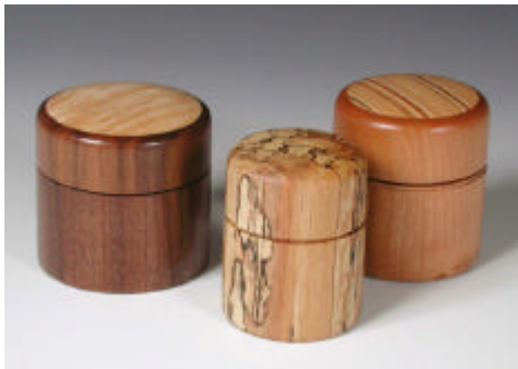
Boxes by Mark Irving.

Use a plain neutral background. Graduated, plain gray, or white seamless paper only – no colors, bed sheets or table tops. Minimize distractions.