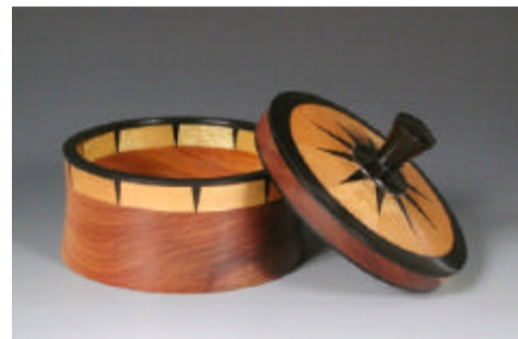
Segmented box by David Vaughn. Photo

Compose the object in the frame. The image must “float” properly. Don’t fill