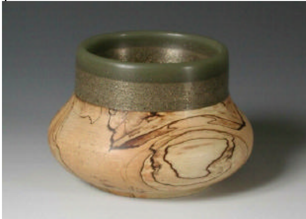
Epoxy and spalted maple bowl by Burt Truman.

the frame – the object must have “breathing room”. The longest dimension should fill around \frac{3}{4} of the frame. Don't center the object, place it low enough in the frame to “ground” it. Don't center that special wood knot or grain feature – turn it partly away from