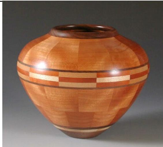
Segmented vessel by Mark Irving. Regrets from the editor that you can't

Use a tripod to allow for long exposures and control the framing. Use a long lens to reduce distortion. For 35mm cameras use 80-150mm lens or zoom setting, and an aperture of at least f.8 – preferably higher than f.11 to maintain depth of focus. Digital cameras zoom all the way in. Don't use macro mode unless the object is very small, use the