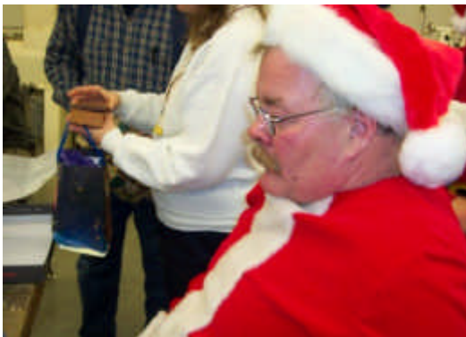
Santa waiting for his cookies and milk.