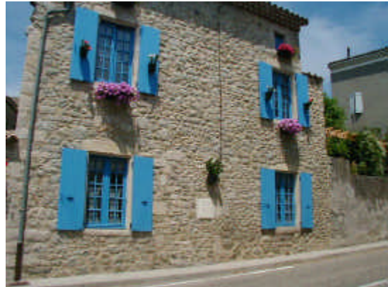
Puy Saint Martin, France

Puy St. Martin has an approximate population of 600 and is north of Provence in the Drome Valley. Forty two demonstrators from ten countries and three continents presented 80 different subjects in four days. Participants came from all over the globe as well.