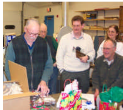
Present swap time.