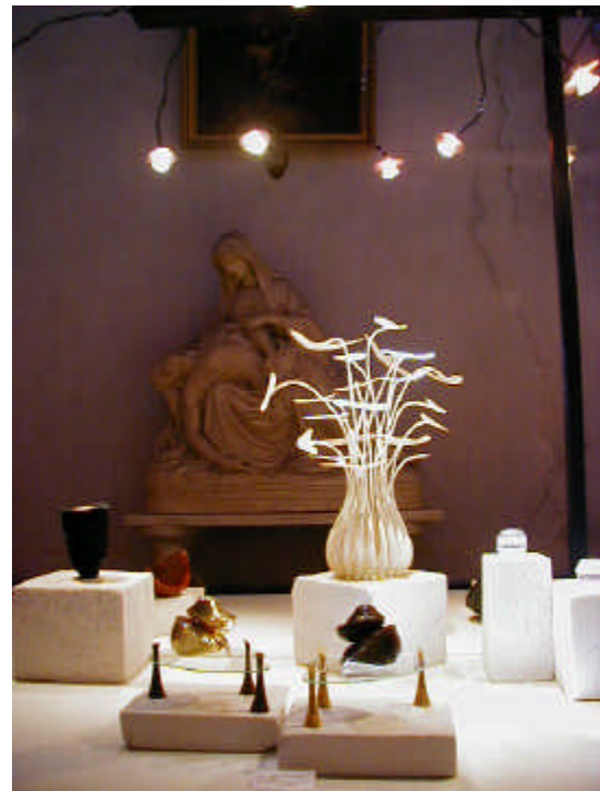
The local chapel, already with art of its own, became a gallery for modern wood-

The demonstrators from abroad were like a "Who's Who in Turning" - David Ellsworth