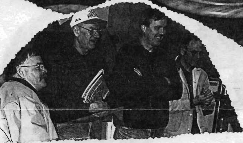
Several of our members look on at your Christmas YANKEE RAFFLE