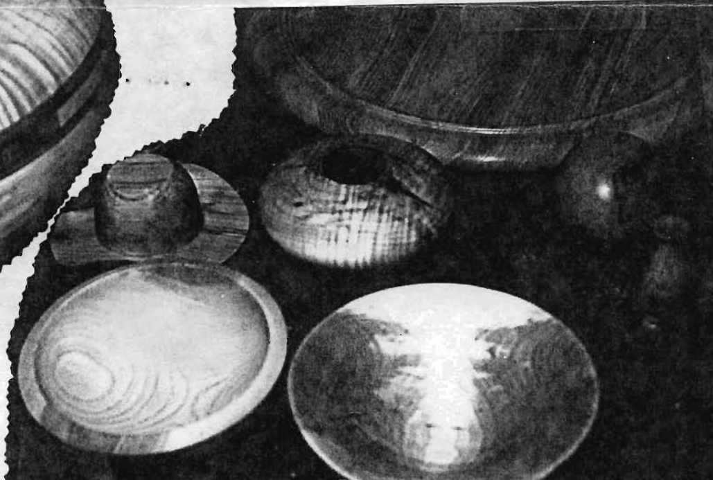
Show & Tell