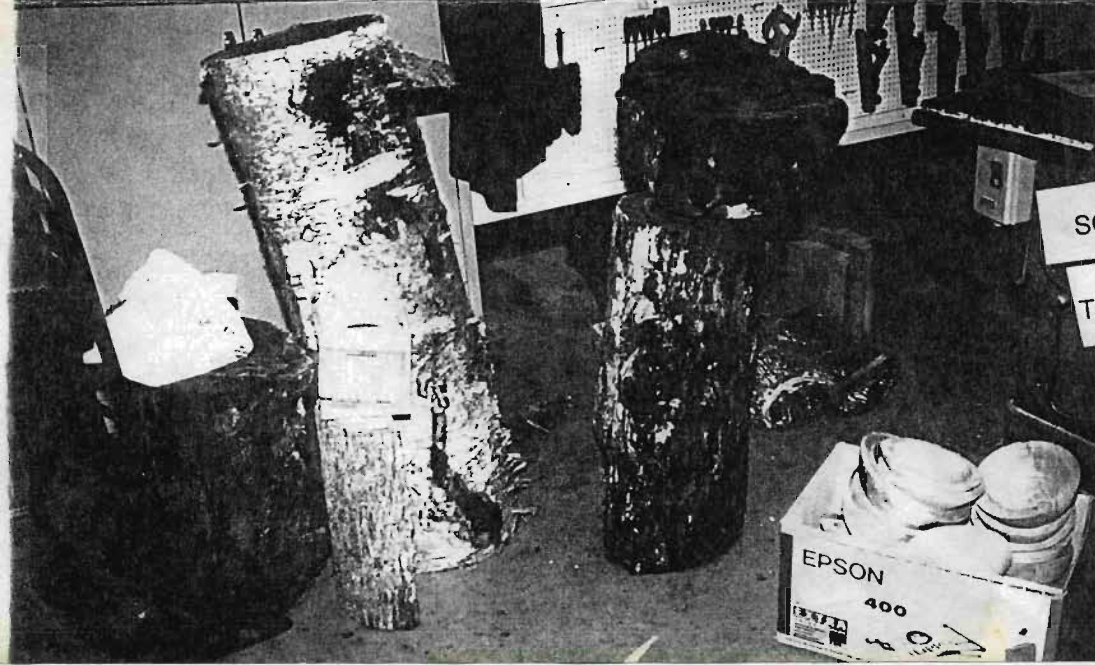
SOME OF THE WOOD BROUGHT IN FOR THE AUCTION BY VARIOUS MEMBERS