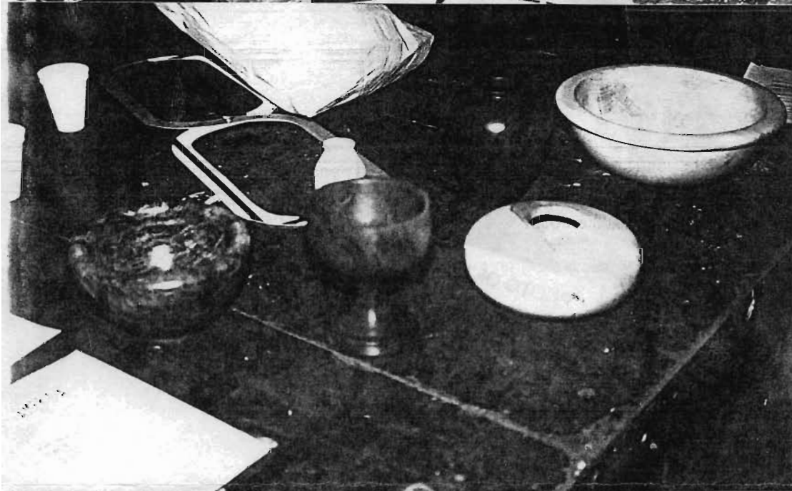
OTHER SHOW & TELL PIECES